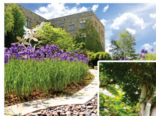
Beryl Ivey Garden

Studies have shown that community engagement plays an important role in the promotion of psychological wellbeing – try volunteering at a community garden!